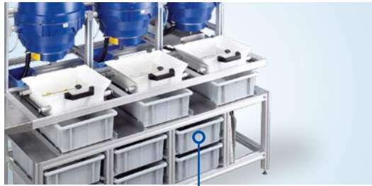
Manual separating unit using manual screen